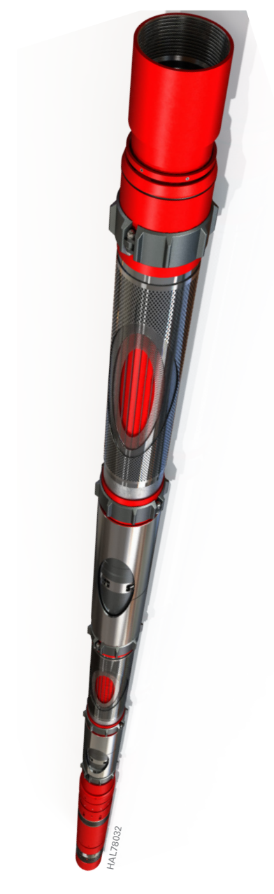
ESTMZ<sup>™</sup> Enhanced Single-Trip Multizone System